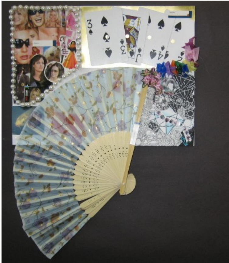
All images by grade 5-8 students